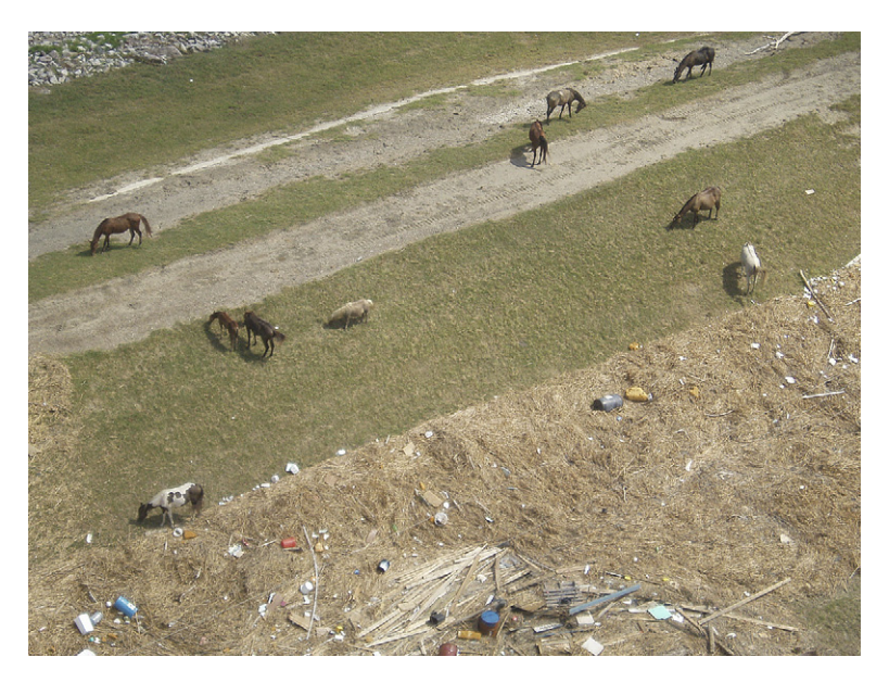
Fig. 4. Horses able to escape to high ground (levees) survived the storm surge and flooding in Plaquemines Parish, Lousiana, in September 2005 during the aftermath of Hurricane Katrina. Note the debris fields on either side of the levee.

pumps or generators should be available in case of electrical outages. Producers should make their local extension office aware in advance of the numbers of animals and their locations. This helps to ensure that your animals are included in immediate feed distributions if available. Otherwise, feed may not be distributed until this information can be verified, which puts the animals at risk.