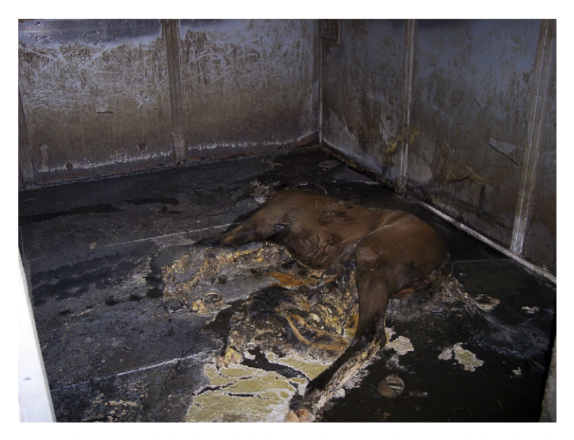
Fig. 3. Weanling horse left in the stall during Hurricane Katrina. Note the hoof marks and water line on the stall walls where the horse attempted to escape.

regional, or local producer groups; livestock auction markets; and feed stores. Different tasks, such as livestock hauling; feed, fuel, and generator acquisition and distribution; and animal evacuation, rescue, and treatment, should be assigned to individuals or groups in advance. Primary and contingent holding areas for evacuated or rescued livestock (eg, show facilities, race tracks) as well as staging areas for feed and fuel distribution should be identified in advance. Special evacuation routes for livestock should be considered so that loaded trucks and trailers can keep moving to avoid development of heat stress in transported animals. Along with the numerous human lives lost during the traffic gridlock evacuation of the Texas and Louisiana coastal regions before the landfall of Hurricane Rita (autumn of 2005), hundreds of horses and cattle perished because of heat stress while being transported. Roads may be closed to trailer and towing traffic as a storm approaches. Early evacuation is imperative to avoid these problems.