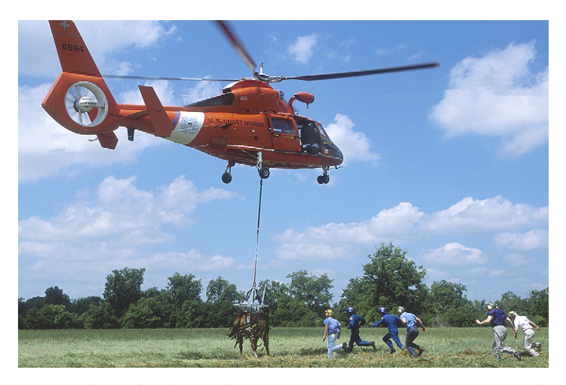
Fig. 5. Rescue of horse from flooded farm area in April 2001 during Tropical Storm Allison in Pineville, Louisiana.

sustained traumatic injury associated with fleeing the rescuers, and were difficult to restrain chemically and prepare for rescue. Eventually, all 16 horses were safely transported by boat using short-acting general anesthesia or an Anderson sling combined with Coast Guard helicopter rescue (Fig. 5) [6].