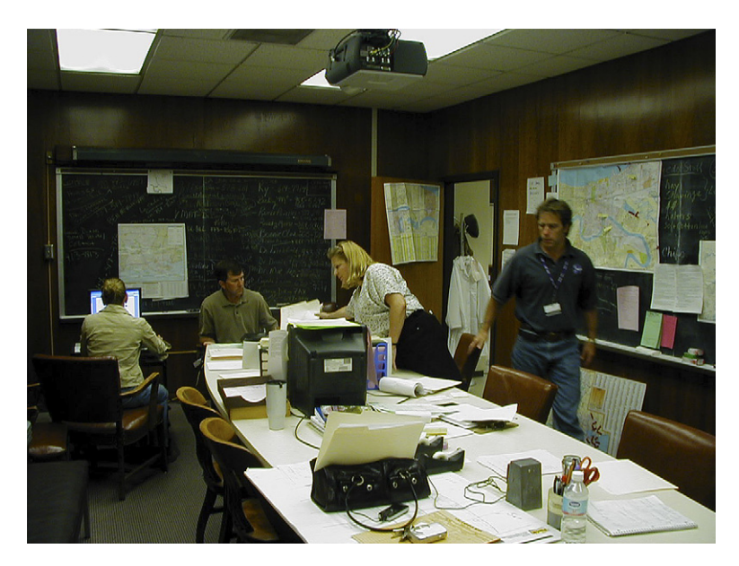
Fig. 6. Equine branch communications center at Louisiana State University, School of Veterinary Medicine, in September 2005 during the aftermath of Hurricanes Katrina and Rita.

known animals in need of rescue or urgent medical care and were then grouped into geographic location.